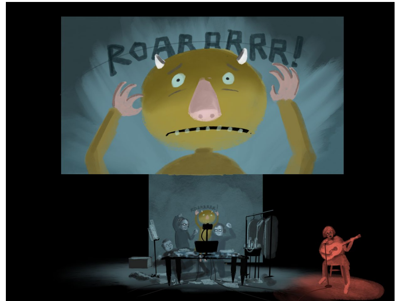
preliminary stage mock up image (not to be distributed publicly)