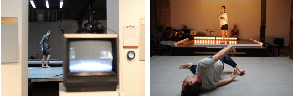
The People to Come - Photo: Julieta Cervantes