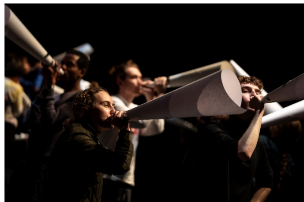
Last Audience