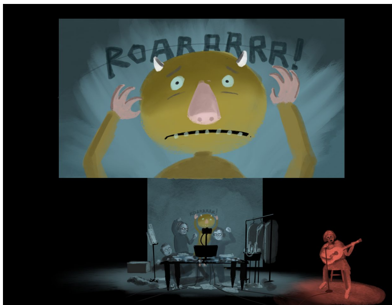
preliminary stage mock up image (not to be distributed publicly)